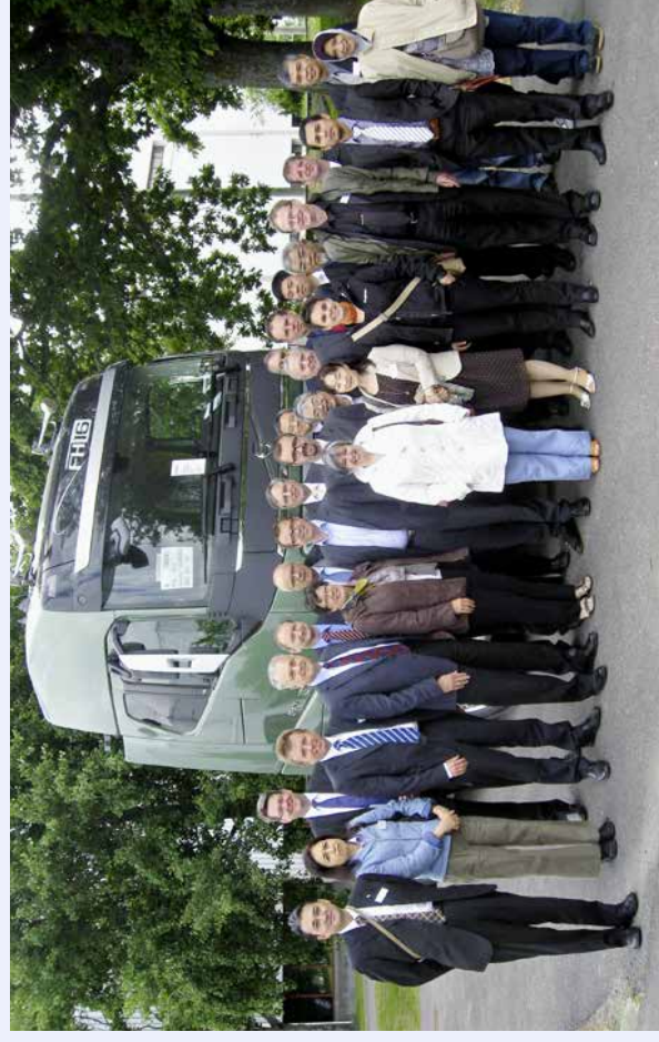
Global automobile experts at the Volvo truck plant in Göteborg, Sweden.