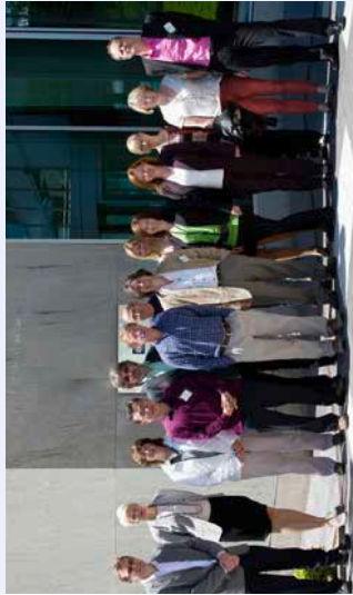
Fourteenth ISO Secretaries' Week held in June 2013 in Geneva, Switzerland.